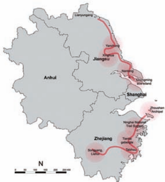
An indication of the areas Den Hartog plans to walk for the rural research project